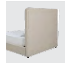
UPHOLSTERED ON ALL SIDES