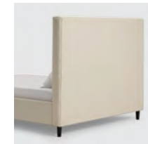
UPHOLSTERED ON ALL SIDES