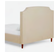
UPHOLSTERED ON ALL SIDES