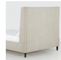
UPHOLSTERED ON ALL SIDES