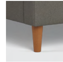
VARIOUS LEG OPTIONS